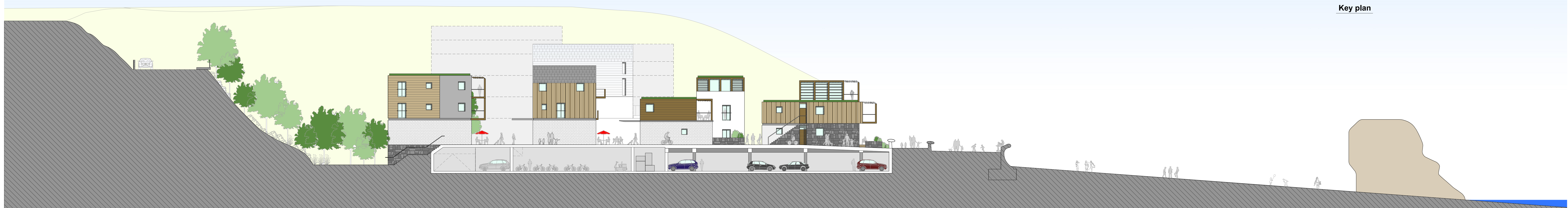
Elevation A Section through pedestrian beach access