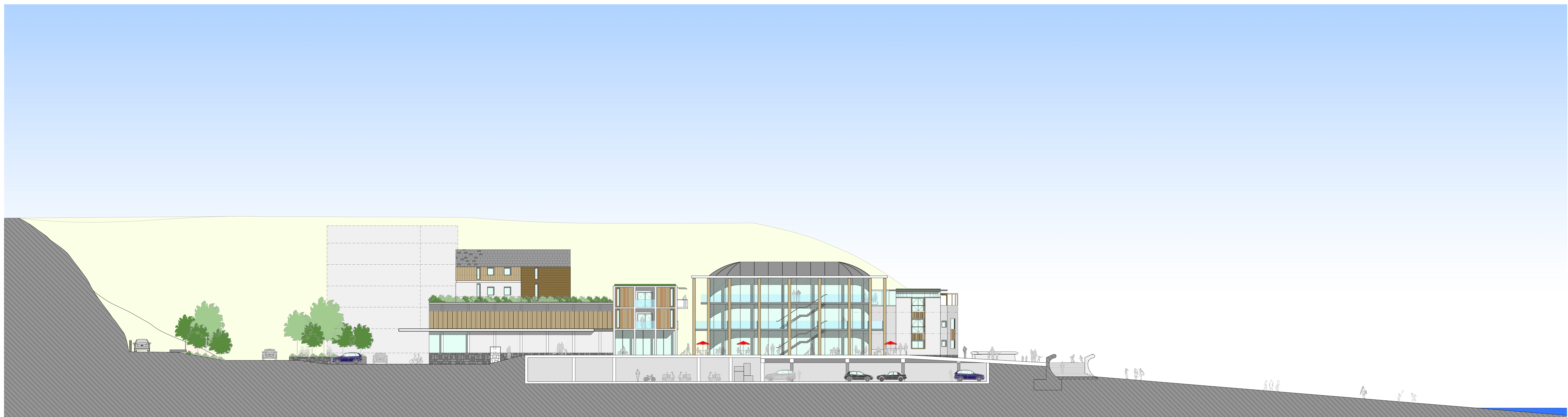
Elevation B Section through main town square